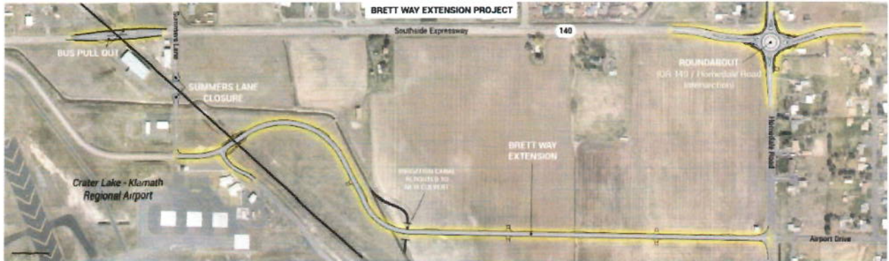
EXHIBIT A - THE "SITE"